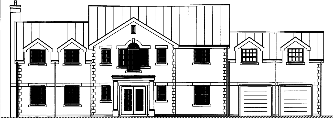
Approach Elevation As Proposed